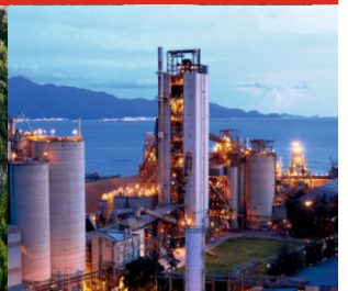
Oil & Gas Plant